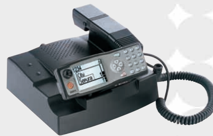
Desk Mount Unit