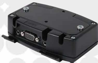
Application Interface (AIU)