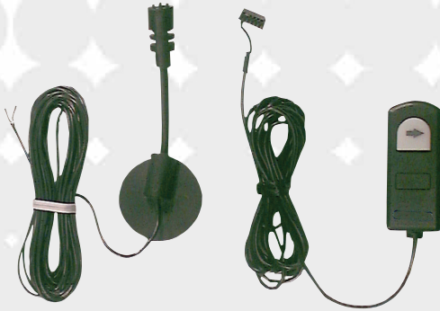
Hands Free Kit